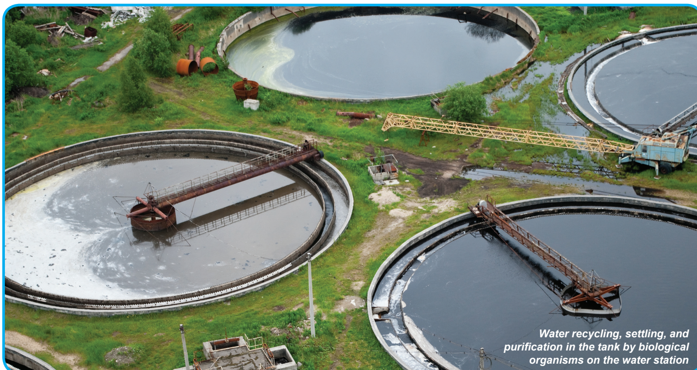
Water recycling, settling, and purification in the tank by biological organisms on the water station