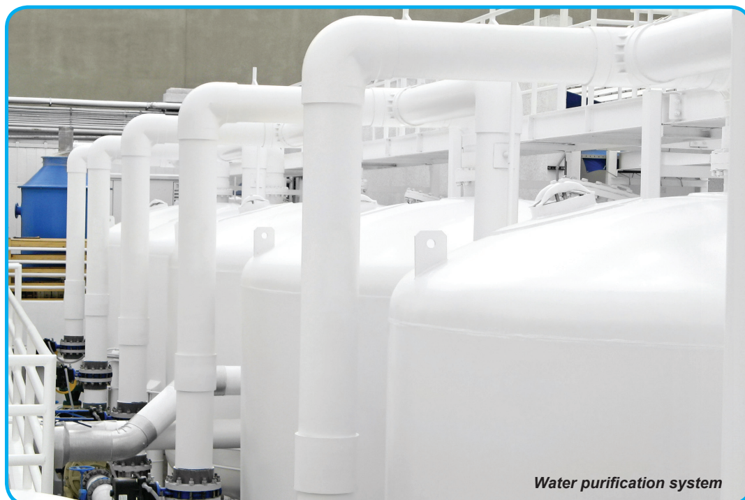
Water purification system

Extreme care needs to be taken with the use of nanotechnology in water treatment. Investigations to seek ways of removing nanoparticles from treated wastewater before discharge into the environment should be undertaken. Nanotechnology risk assessment research for establishing the potential impacts of nanoparticles on human health and the environment is crucial to aid in balancing the technology's benefits and potential unintended consequences. Scientific authorities acknowledge this as a massive challenge, since monitoring the huge volume of diverse nanoparticles being produced and used and their consequent impact is very difficult to track.